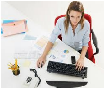
Training / work