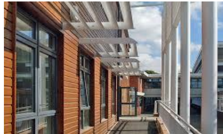
School 6th form